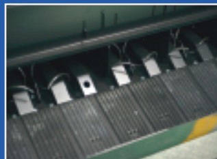
弹簧货仓 Spiral Tray