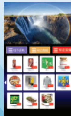
• 个性化UI系统定制 • Customized UI system