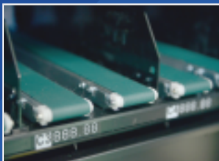
履带货仓 Conveyor Belt Tray