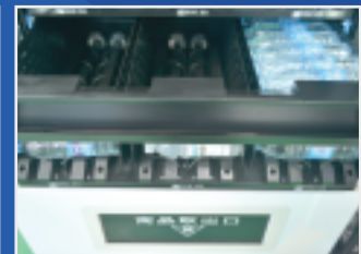
大容量货仓 High Capacity Drink Tray