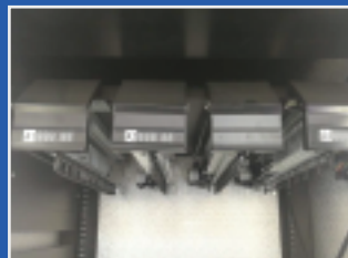
挂钩货仓 Hanger Tray