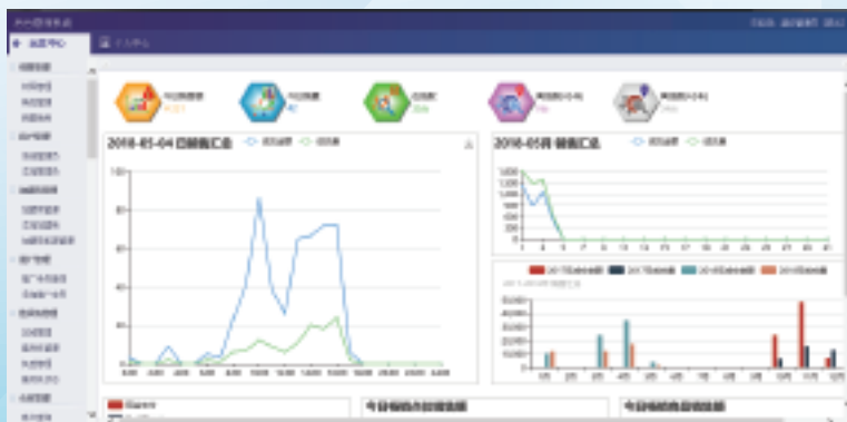
• 云后台报表系统 • Remote monitor report system